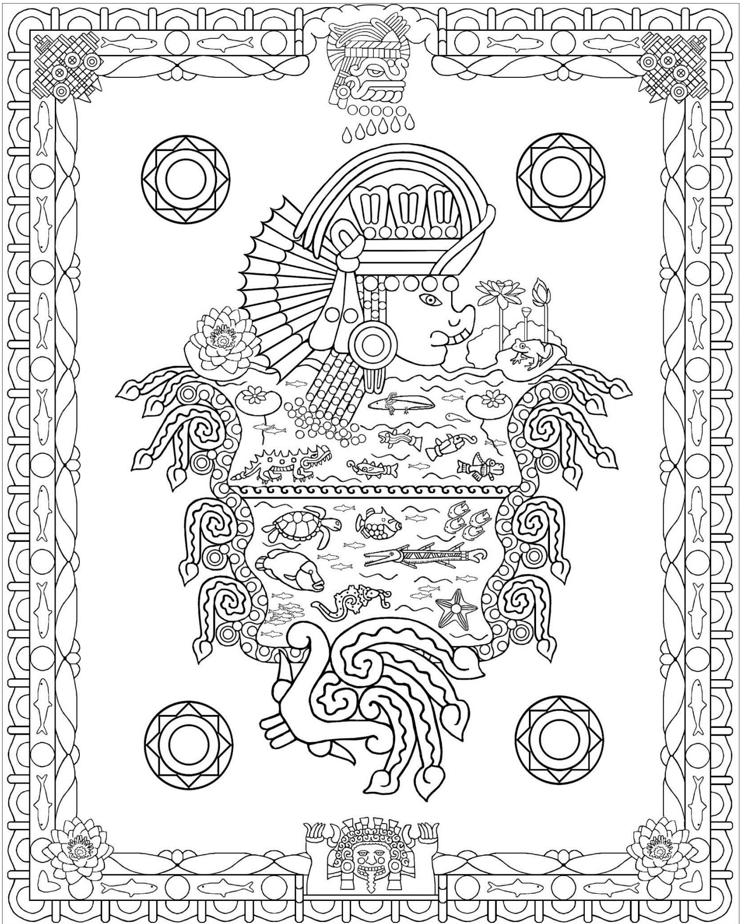
AZTEC ICON #1 – ATL, God of Water