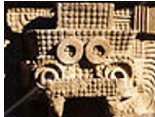
MASK OF TLALOC, TEOTIHUACAN