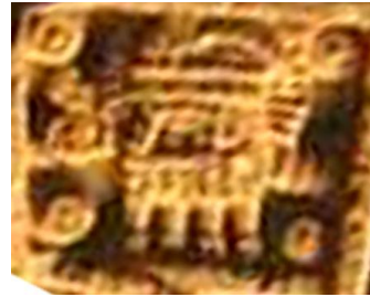
(from the Stone of the Suns) Quiahuitl

While there were many Codex images of fishy creatures, most were quite fanciful, and I only used a few, otherwise, shamelessly drawing from nature.